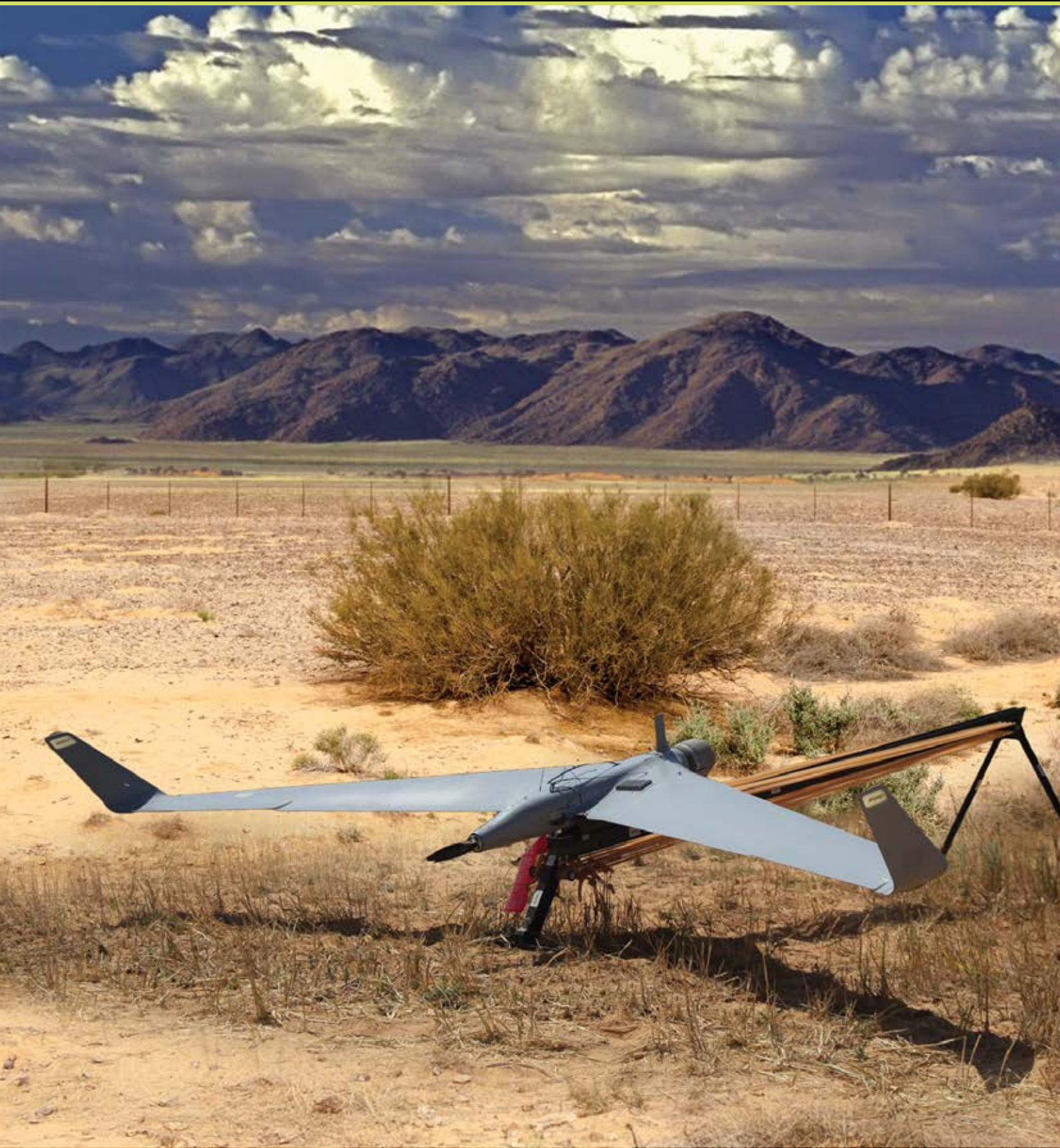
Orbiter® 2 Mini UAS